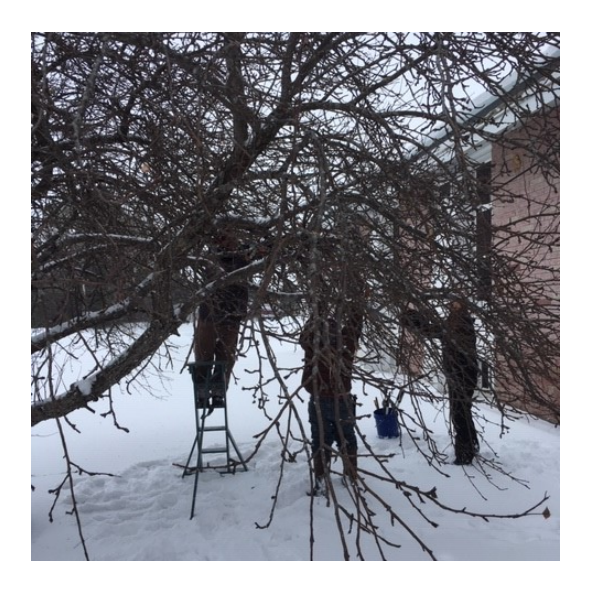
Fruit Tree Pruning Demonstration